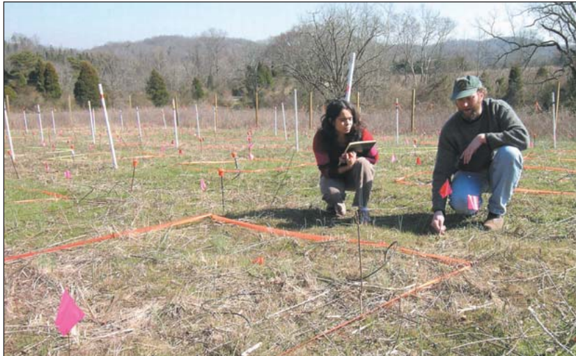
Figure 2. Intellectual contribution in ecology can be difficult to quantify because field technicians or undergraduate students may provide important, informal observations that can easily be under-acknowledged by principal investigators. The informal contributions may drive future research, direct data analyses, and contribute to manuscripts. Communication among potential contributors before, during, and after a project is critical to ensure assignment and acceptance of responsibility. Each contributor is responsible for drafting his or her own byline; the guarantor is responsible for evaluating each byline relative to the others, and for maintaining internal consistency.

willing to be held accountable for its contents and not be just responsible for a portion of the work involved. In contrast, an acknowledgee may contribute formal or informal ideas to ongoing projects, collect enormous amounts of data, and develop and/or conduct statistical analyses, but may not be accountable for the final contents of all or even portions of the final manuscript. Open communication about the roles, responsibilities, and expectations for authors as opposed to acknowledgees should be ongoing during the writing process.